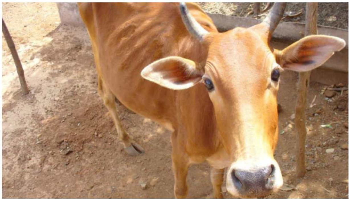
The department said that the implementation of the "One Health Framework" will allow tracking and resolution of animal and human health challenges and will prevent possible infection and disease outbreaks.

Press Trust of India | September 24, 2021 13:36:21 IST