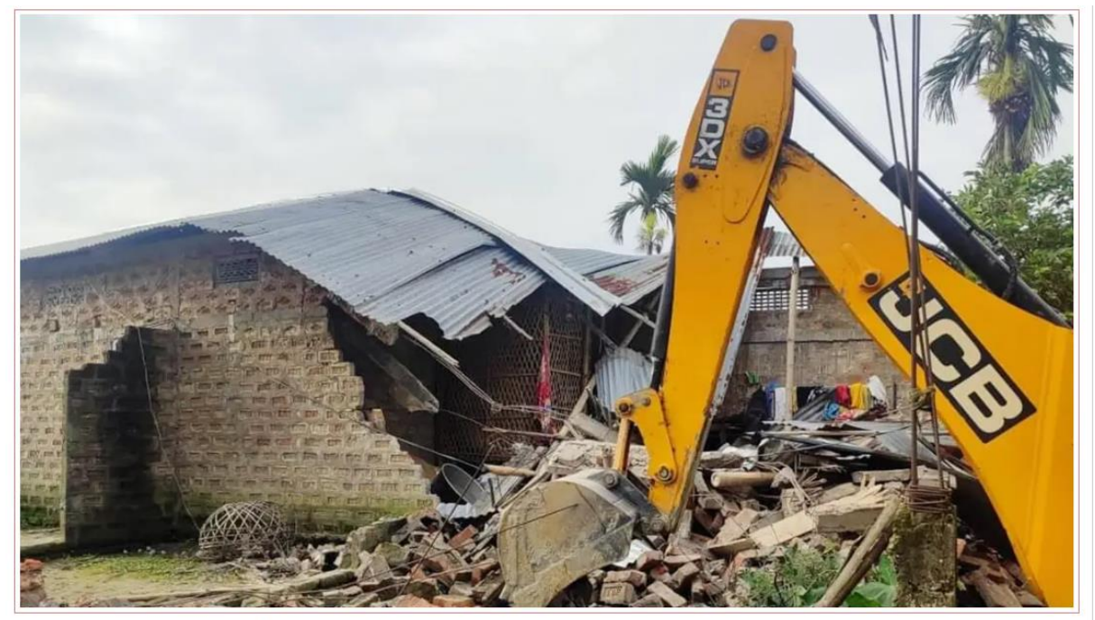
Eviction drive in Nagaon