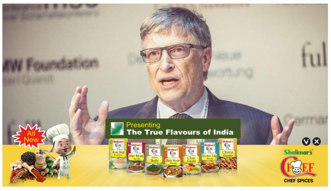
The MoU aims to protect the economic well-being of small-scale livestock producers./Bill Gates |