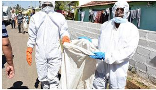
A file photo of members of the Rapid Response Team in a village affected by bird flu in Mysuru. The One Health Framework is aimed at improving national and State-level resource allocation and policy ecosystem on early prediction, detection, and diagnosis of zoonotic diseases through increased quality, availability, and utility of data evidence.

Karnataka will be one of two States where the 'One Health' programme will be piloted, the other State being Uttarakhand.